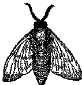
Figure 2: A sample black and white graphic (.eps format) that has been resized with the epsfig command.

This uses the theorem environment, created by the